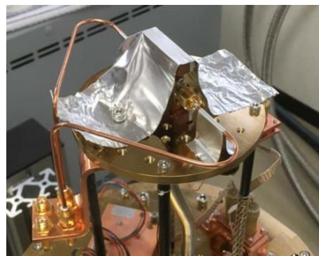
KID detector and 3He cryocooler