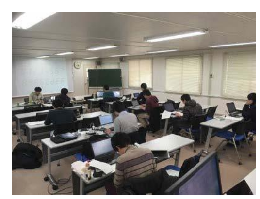
FPGA training course (2016)

In this course, we will use Xilinx Artix-7 FPGA with Vivado. The students are expected to install Vivado on their computers before the course. We do not recommend to use virtual machine.