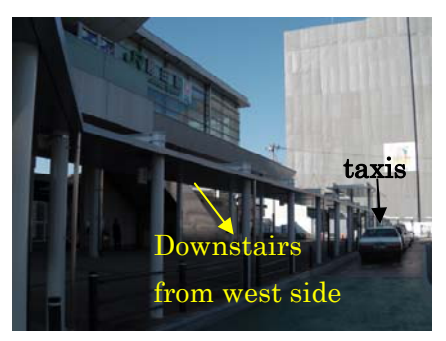
Fig 3: East side of Katsuta station